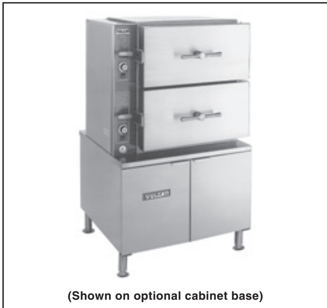
(Shown on optional cabinet base)